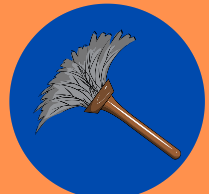
DUST OR DIRT